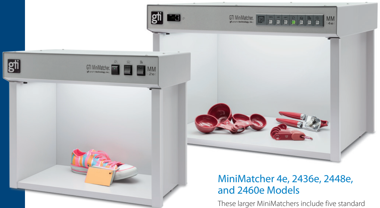
MiniMatcher MM-2e (left) and MM-4e (right)

Affordable Tabletop Color Matching and Inspection Systems