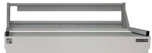
GTI's GLE (left) and GLL (right) series luminaires, shown with wall brackets, are available in four foot models. GLE luminaires have a front power switch and a power cord which plugs into a standard outlet. GLL luminaires must be hard wired into a switched power circuit. Both models are available with a wireless remote control.